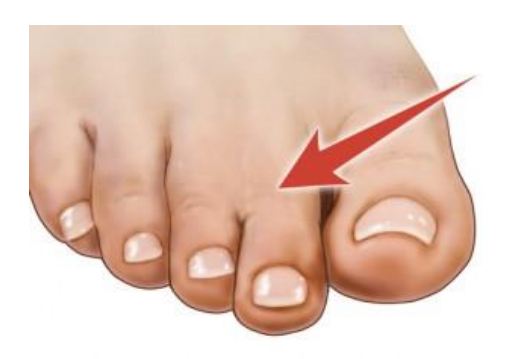
BIG TOE: DOMINATE \rightarrow BIG TOE IS SHORTER THAN 2<sup>ND</sup> TOE