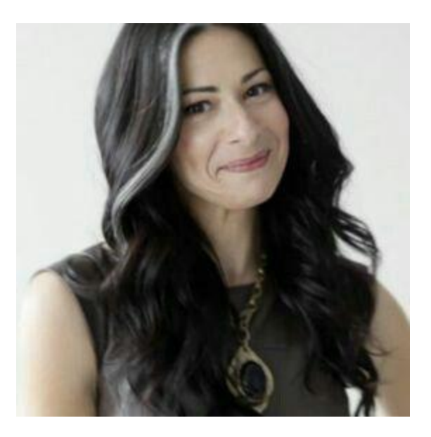
HAIR BLAZE (BLACK OR WHITE STREAK): DOMINANT→ PRESENCE OF A PATCH OR STREAK