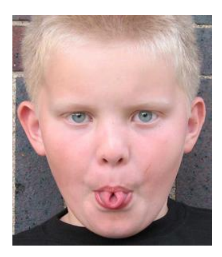
TONGUE ROLLING: DOMINATE \rightarrow U-SHAPE CURVE