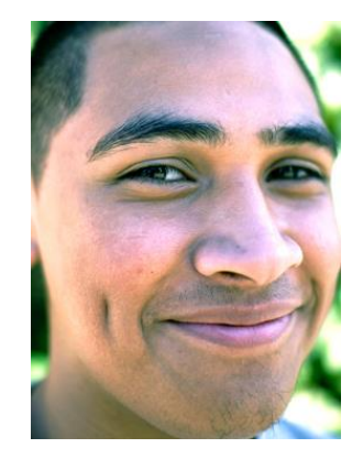
DIMPLES: DOMINATE → HAVING FACIAL DIMPLES