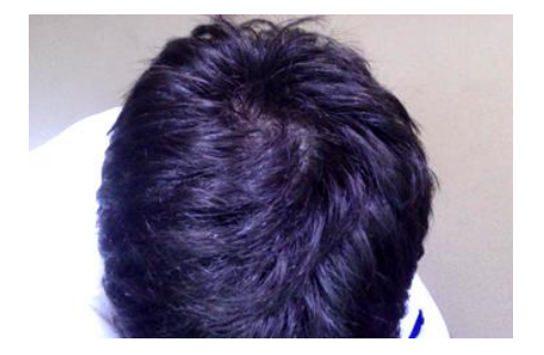
HAIR WHORL: DOMINATE \rightarrow CLOCKWISE TURNS