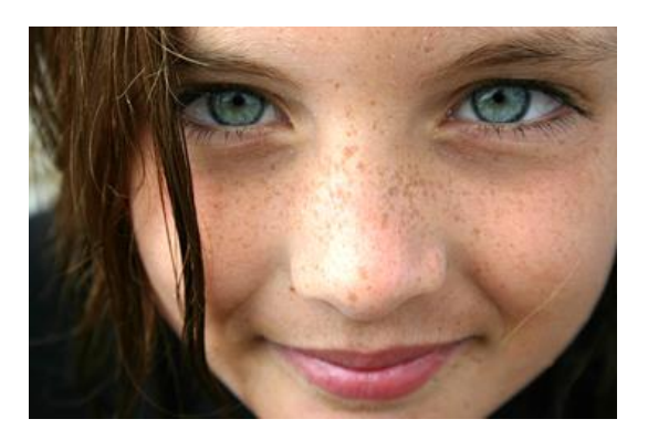
FRECKLES: DOMINATE \rightarrow HAVING FACIAL FRECKLES