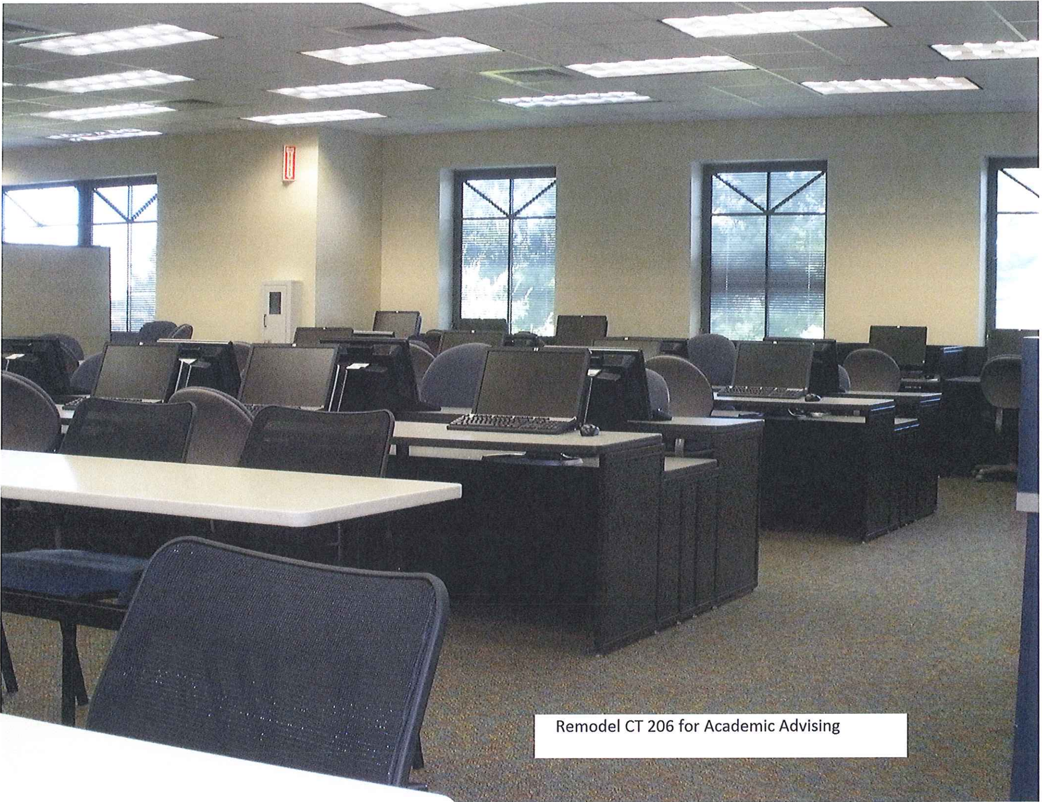
Remodel CT 206 for Academic Advising