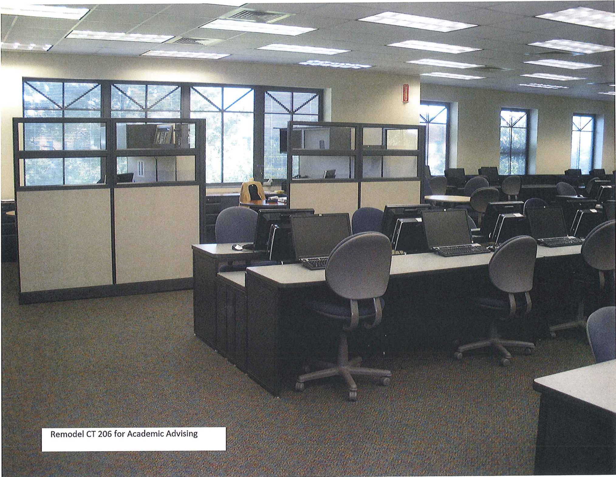
Remodel CT 206 for Academic Advising