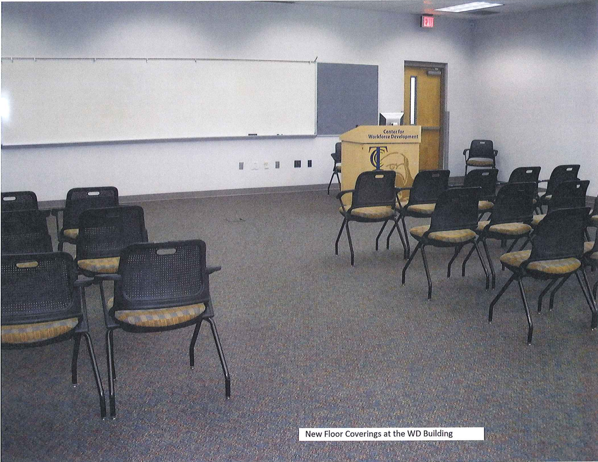
New Floor Coverings at the WD Building