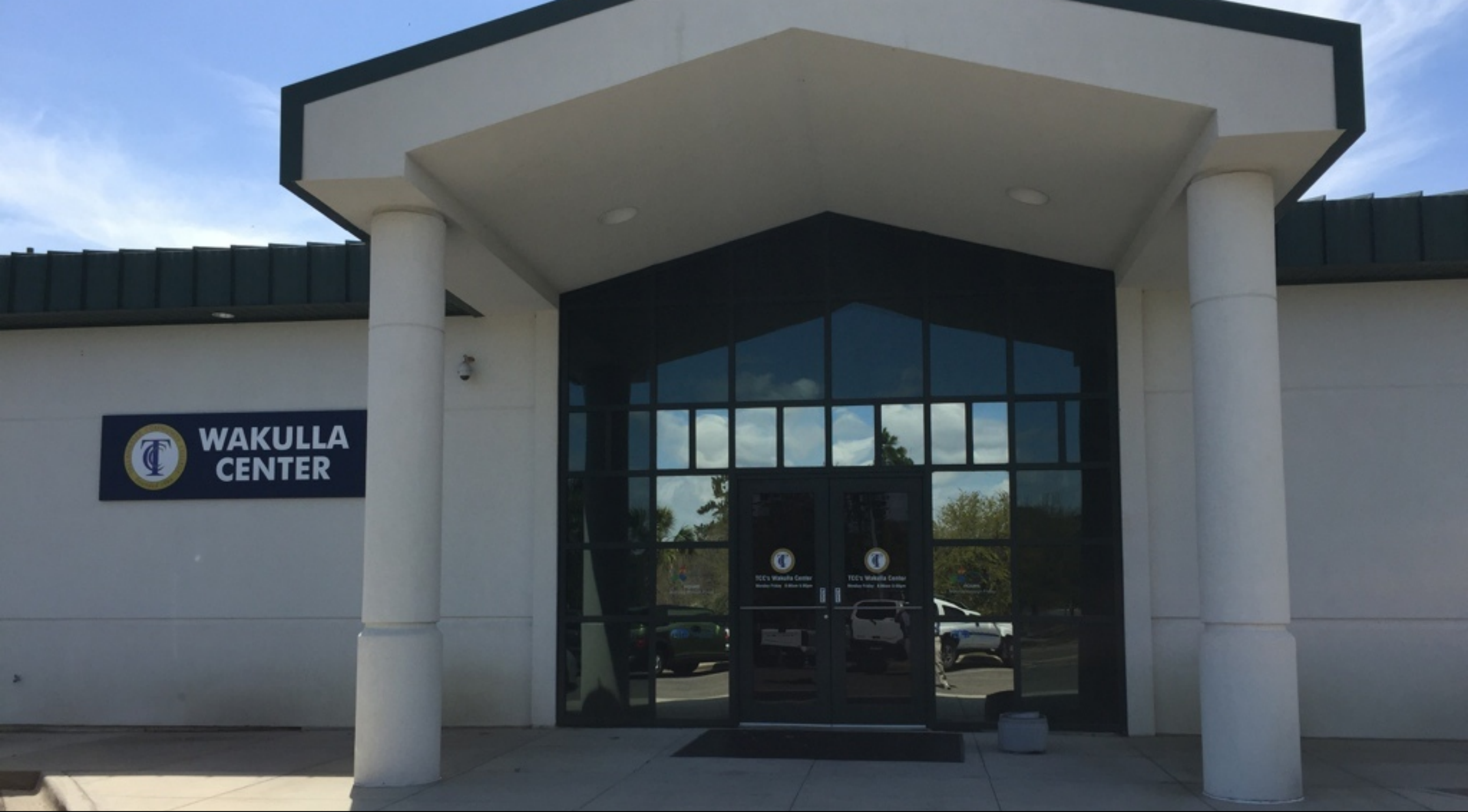
TCC Wakulla Center